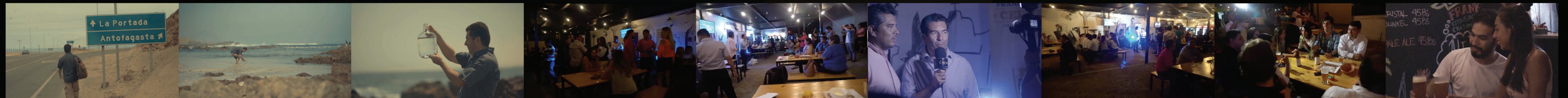
Antofagasta-Chile: Recollecting seawater